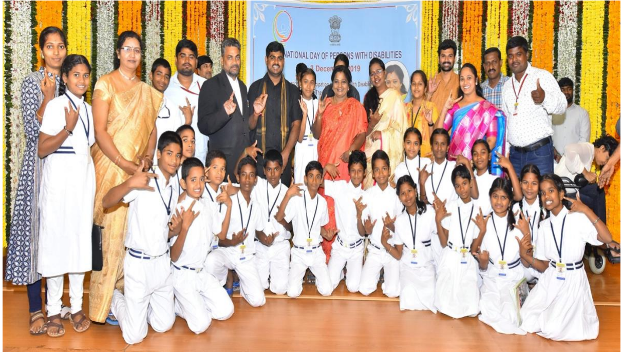
PHIN Students with Honourable Governor of Telangana State